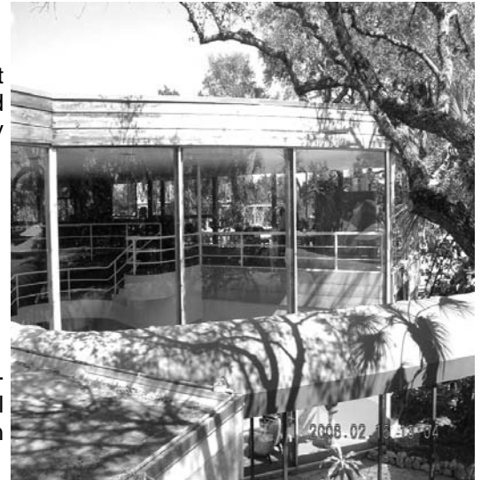
Thank you Snavelly Development

RESERVE EARLY...Attendance is limited to 100.